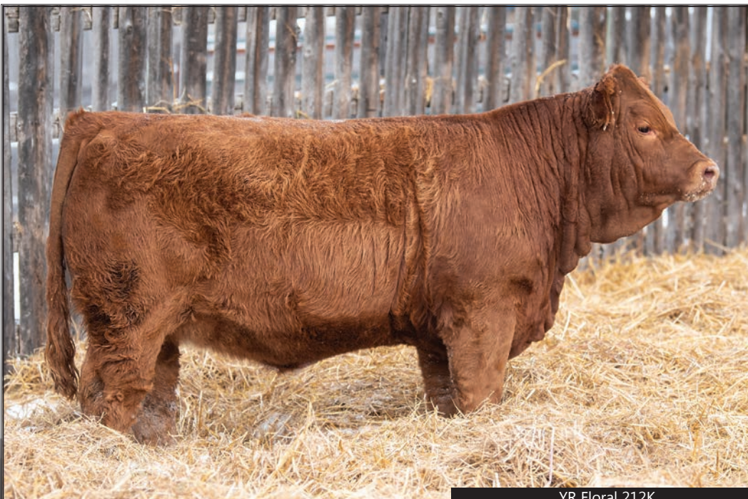
YR Floral 212K

Proud to be offering our first daughter from our new herd bull Deeg Wallstreet 70H (Tycoon son). He's has done an amazing job with his first calf crop, with many daughters being kept and bulls in the sale pen. This young lady's dam is a young Iginla daughter, which just like her half-sisters, raise the "right kind" every year. She is a very broody, wide based heifer that has the makings to be a high producer for the new owners. A great investment opportunity.