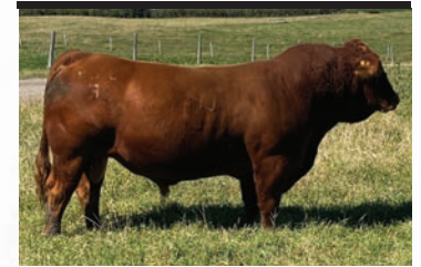
LFE RS Lewis 329F - Sire

This "Razor" daughter has got to be one of my favourites ever. She has such a sweet disposition. Her length of body is unreal, with that sweet extension from her shoulders to head. The "Razor" sons are the heavy weights in the bull pen for another year. He passes on such ideal calves, and the daughters getting ready to calve are extremely exciting. If your looking for a junior prospect to show or have that standout cow have a look here.