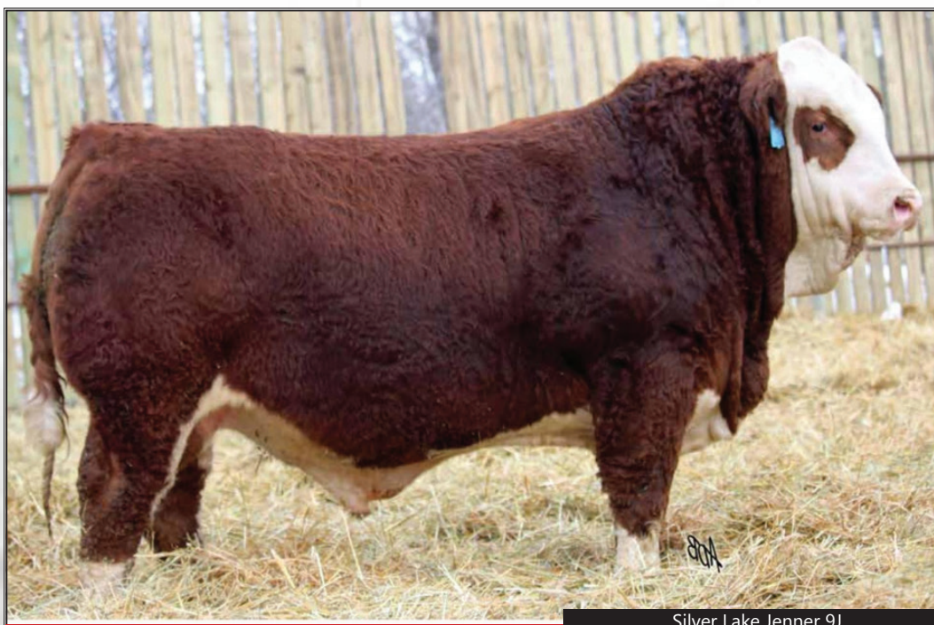
Silver Lake Jenner 9J

consigned by First Class Cattle Marketing