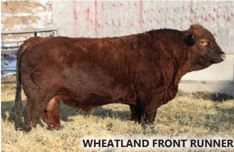
WHEATLAND FRONT RUNNER