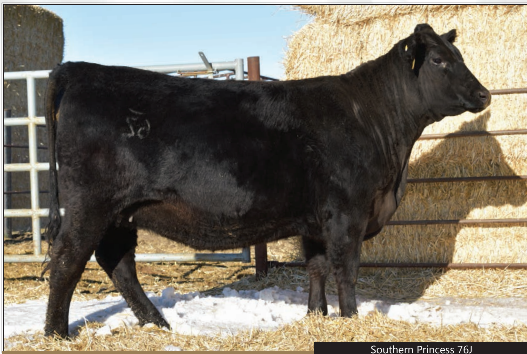
Southern Princess 76J

This deep bodied Tonic heifer is representative of many of the tonic females. Deep bodied, long, correct in structure, solid footed. Confirmed bred.