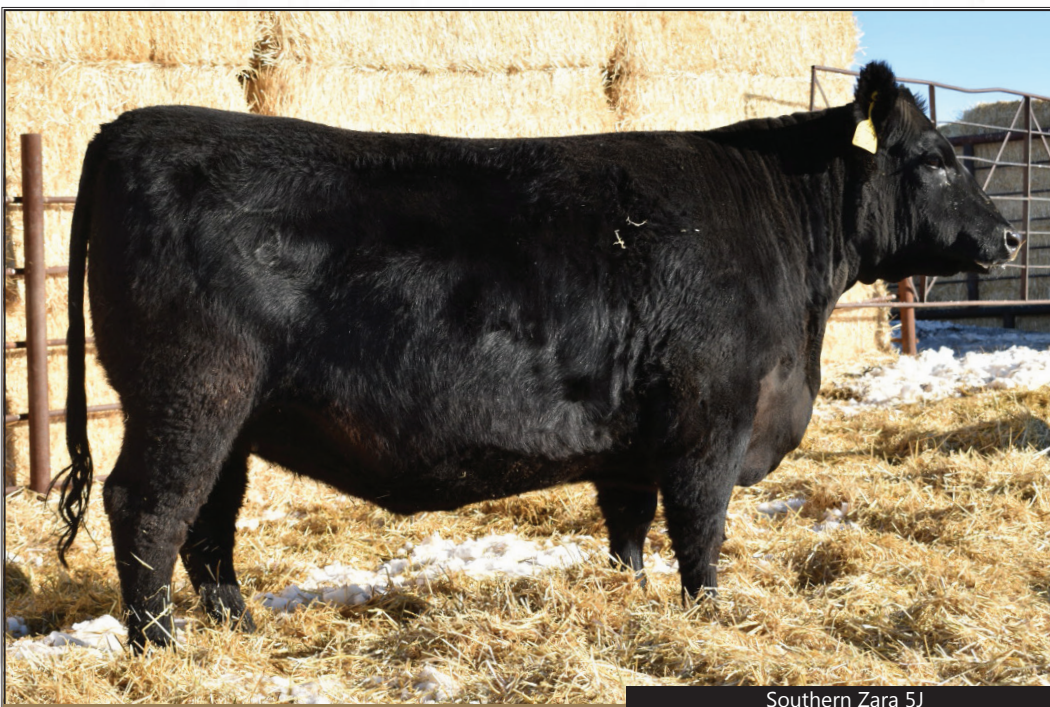
Southern ZARA 5J

This is a powerful soggy heifer that can be bred a number of ways and still be profitable. You simply can't make a mistake with one like her! Serviced naturally to Greenwood Attractive JJP 12J. Opinion is a heifer calf. Confirmed 60 to 70 days on July 29th