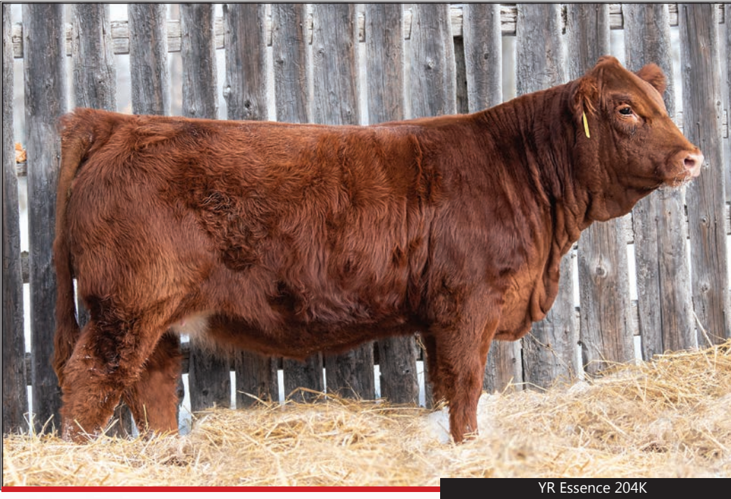
YR Essence 204K