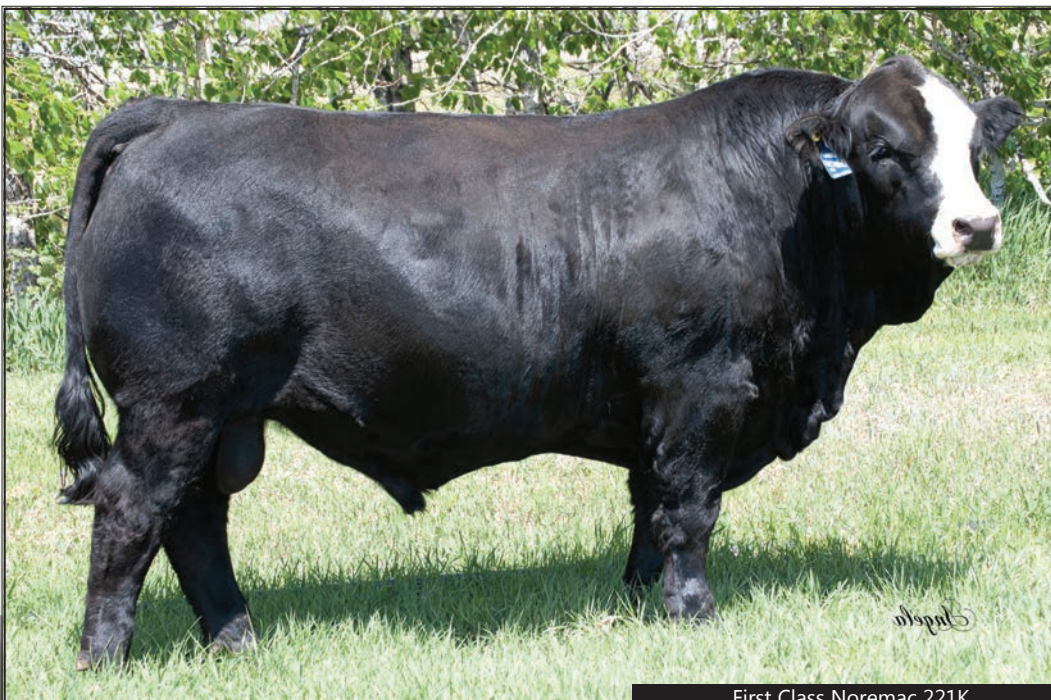
First Class Noremac 221K

consigned by First Class Cattle Marketing