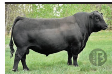
Lucas Tonic 654S - Sire

Approximately 60 to 70days on July 29th with a bull calf being the opinion. Serviced naturally to Greenwood Attractive JJP 12J.