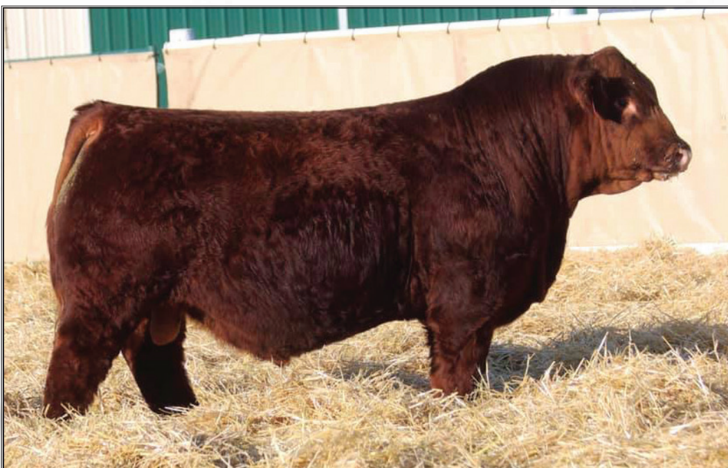
Wheatland Next Century 43H

This will be the last semen to sell for the 2023 breeding season.