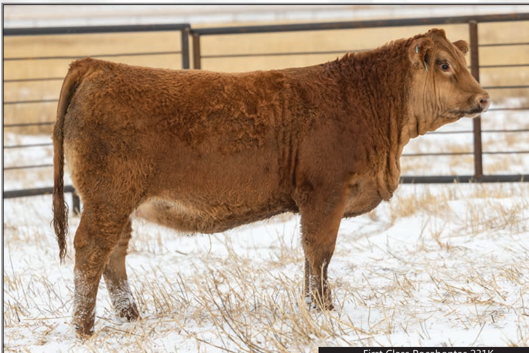
First Class Pocahontas 231K

231K is most definitely the power female of the group. She is absolutely massive in every way and loaded with volume. Top it off with a tremendous amount of hair, a good foot and smooth front end she is destined for great things. Here's a heifer that will have lots of friends sale day!