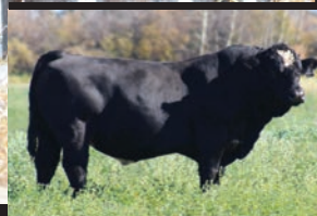
Unlimited 401G - Sire

Prim n Proper has the complete look. Her extension through her front end leads into a deep full rib and lots of top. Prim has got to be one of the most eye appealing females I have raised, and the close to perfect blaze just adds to her package. Her dam is a moderate framed female that weaned off a bull calf Sept 1 at just shy of 1000 lbs. 144J has the power and performance in her makeup. She is setting down a beautiful udder just like her dams. Prim has a maternal sister that has been doing a great job at the Willow Creek operation. The Unlimited daughters are set to calve this season and are very impressive in their overall shape and type. 144J is bred to our proven heifer bull CEN Red Fuel 482F.