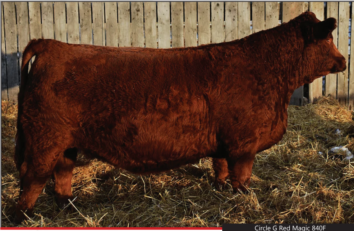
Circle G Red Magic 840F