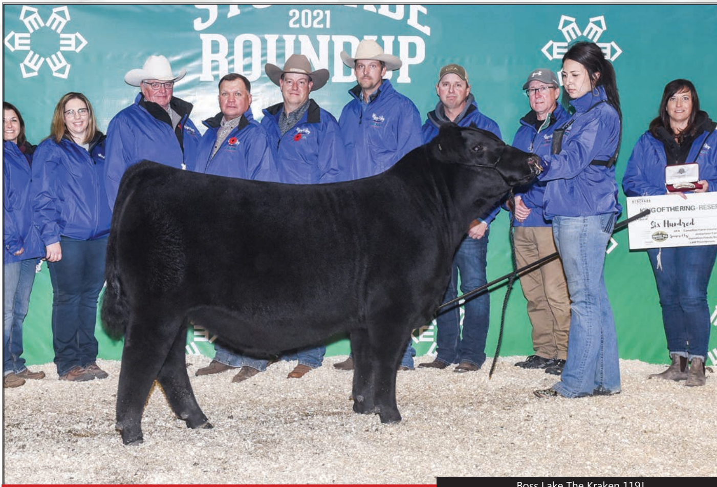
Boss Lake The Kraken 119J