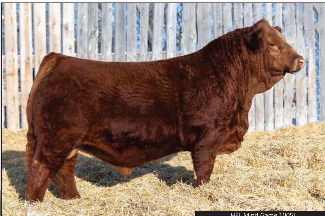
HFL Mind Game 1005J

consigned by First Class Cattle Marketing