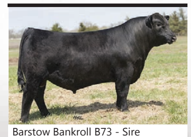
Barstow Bankroll B73 - Sire

This is a powerful soggy heifer that can be bred a number of ways and still be profitable. You simply can't make a mistake with one like her! Serviced naturally to Greenwood Attractive JJP 12J. Opinion is a heifer calf. Confirmed 60 to 70 days on July 29th