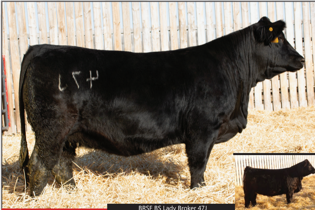
BRSF BS Lady Broker 47J