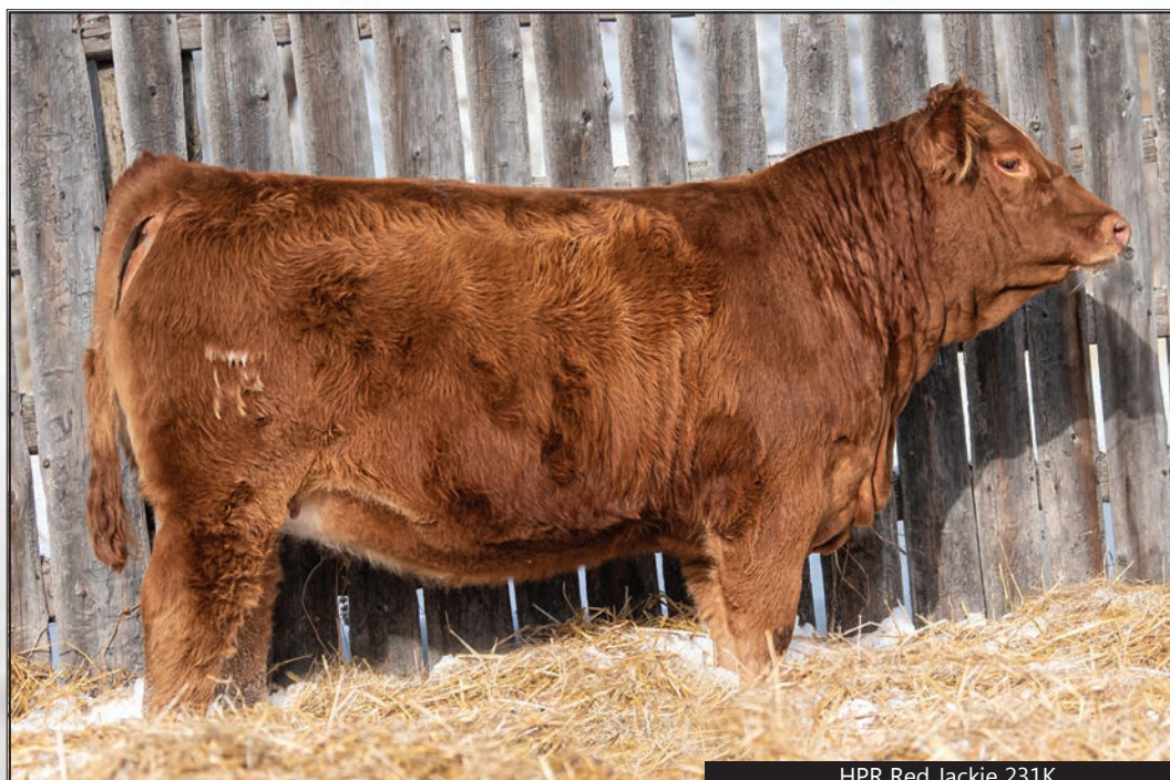
HPR Red Jackie 231K

Jackie is from 2 black parents and has a proven pedigree to back her. Clean fronted, wide based and angular thru her lines. These Unlimited daughters are turning into beautiful cows and we are excited to get the first daughters calved out. Jackie's dam was purchased from Westway Farms in SimPower and she just knocks it out of the park. Jackie will turn into a cow that will produce you a top end bull or females. She will not disappoint the new owner.