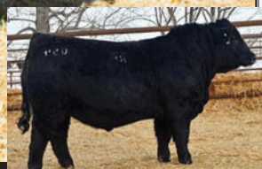
RF Jaguar 054H - Service Sire

HOMOZYGOUS POLLED. I'm not too sure if I'll be able to find a heifer to replace "20J" very easily! She is a beautiful female that I would classify as "Purdy," and has an abundance of qualities that will stop you in your tracks. Dark red, as broody as you can build them, and likely will outproduce anyone in the "Avalanche" cow family if I would have to guess. She's moderate framed, big ribbed female, that has the potential to make those big-time bull calves or front-end replacement females. She will be the first female to sell from our proven herd sire, "RST Freadey," who has surpassed all expectations that we had of him. "20J" quickly rose to be the best red heifer from start to finish and her full sib fits the part just as well at home in the bull pen. Big time production female from the top of the pen at blush, that is sure to drop a gorgeous utter! A female who you can build a herd around, and wish you had 100 of! Bred to our IPU Bentley son from Ranciers, let her go to work!