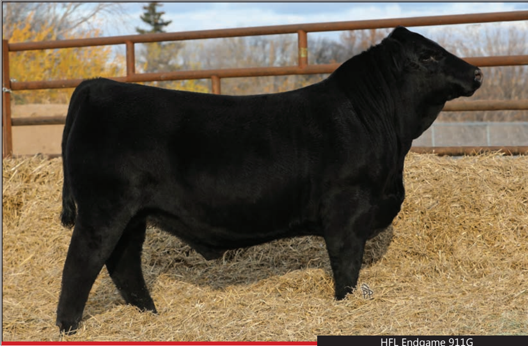
HFL Endgame 911G

This will be the last semen to sell for the 2023 breeding season.