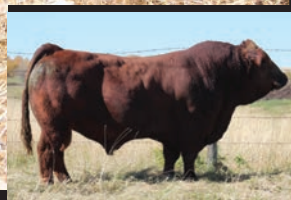
CEN Red Fuel - Service Sire

Primadonna is a powerhouse of a bred. Loads of rib, top and hip. Her maternal brother was our highest weaning weighted red bull and her Aunt had the heaviest black bull at over 1000 lbs Sept 1. Her Milhouse dam is a tank just like her daughter and her production is everything I could ask for. The Casanova daughters are doing a great job in the herd and have nice udders. If you're looking for a herd addition that will bring in those big calves in the fall, take serious note to Primadonna. Cow family that has been doing well in herds either in the bull or female divisions.