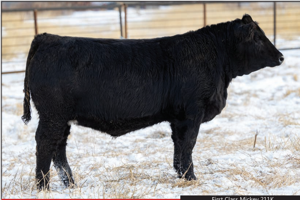
First Class Mickey 211K

211K is younger but very powerful 3/4 blood heifer that came in dam from the meadow acres dispersal. Just an end of March baby, she could be the highest weight per day of age calf in the entire offering. She has a tremendous amount of depth and thickness, and with the new change to the pedigrees coming up she will raise you the purebred bulls you're looking for.