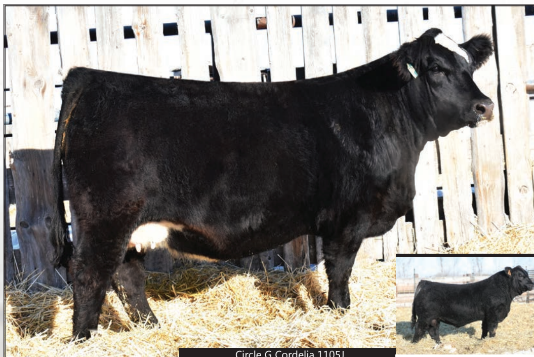
Circle G Cordelia 1105J