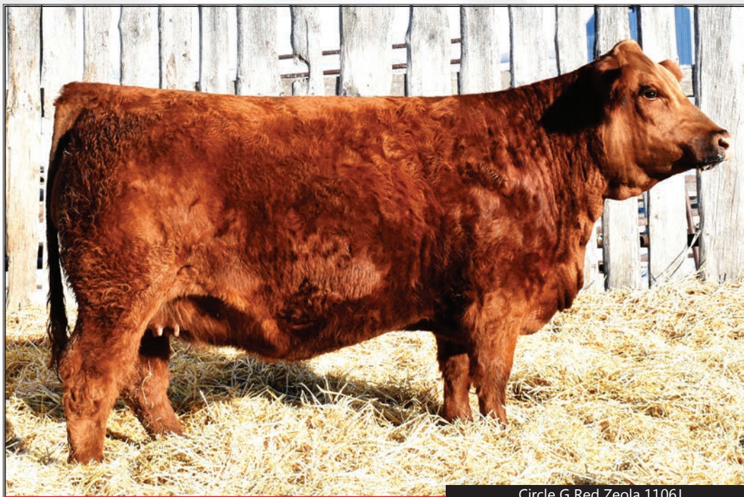
Circle G Red Zeola 1106J

This is a female that should never be leaving Circle G as this kind is extremely rare. Zeola is unmatched in terms of dimension, rib shape, fleshing ability and power yet is attractive with an abundance of maternal strength in her pedigree. 1106J is super sound, has an impressive set of epds and her udder quality will be first rate. Her sire, Aztec, was a dark red, perfect footed son of the elite Sage cow. The set of Aztec daughters are flat out awesome as one would expect with the Sage influence combined with the maternal strength of the Circle G cowherd. Zeola's dam is a model daughter of the $26,000 Circle G Cash bull that has bred so well...her first calf, a Red Heat son, was a 2021 bull sale high seller to South Seven Farms. Zeola 1106J has huge production potential and is the kind that will raise herd bulls. Her mother, grandmother and great grandmother will all have feature bulls in the Circle G Bull Sale February 18, 2023. Zeola carries service to a very good son of Red Heat from an excellent Venom daughter that was retained for a herd sire. Zeola has received rave reviews from visitors and I get excited when thinking what this female could accomplish for her new owners. HOMO POLLED