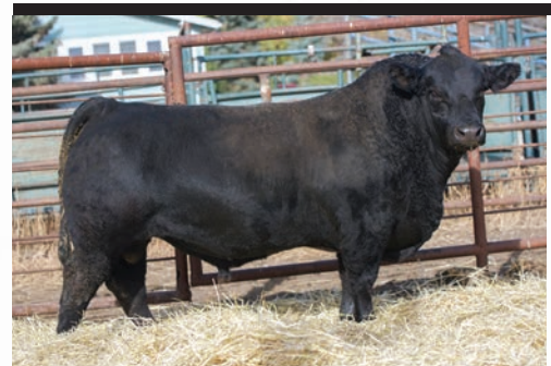
MRC Cash 164D - Maternal Grandsire