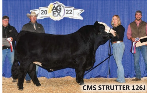
CMS STRUTTER 126J