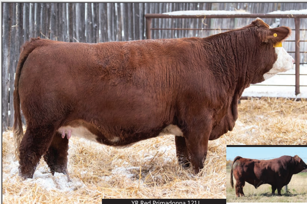
YR Red Primadonna 121J