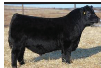
Firebrand 6068 - Sire

Certainly, a female that showcases herself in the flesh. Having the backing of a proven dam, and well known sire, we feel this heifer can be bred in a lot of different ways to suit the style of the buyer, and will not disappoint