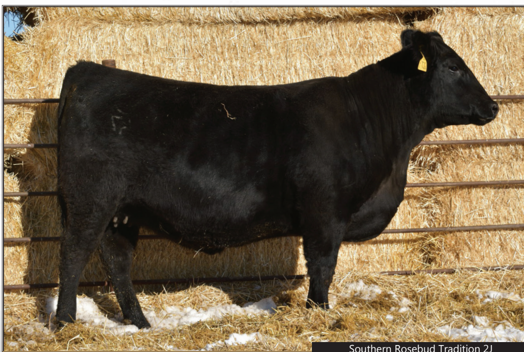
Southern Rosebud Tradition 2J

Kicking it old school with Southern Tradition as this heifers sire! Frame and power in a deep bodied fancy wrapper.