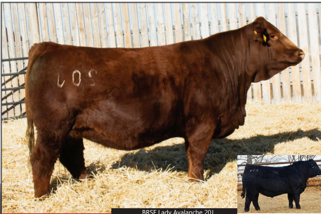
BRSF Lady Avalanche 20J