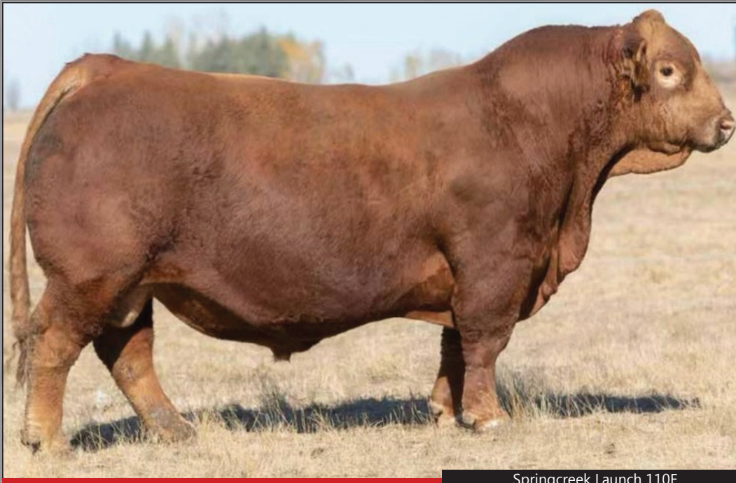
Springcreek Launch 110E

This will be the last semen to sell for the 2023 breeding season.