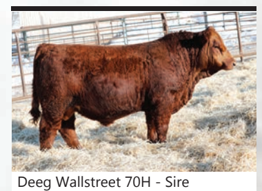
Deeg Wallstreet 70H - Sire

Proud to be offering our first daughter from our new herd bull Deeg Wallstreet 70H (Tycoon son). He's has done an amazing job with his first calf crop, with many daughters being kept and bulls in the sale pen. This young lady's dam is a young Iginla daughter, which just like her half-sisters, raise the "right kind" every year. She is a very broody, wide based heifer that has the makings to be a high producer for the new owners. A great investment opportunity.