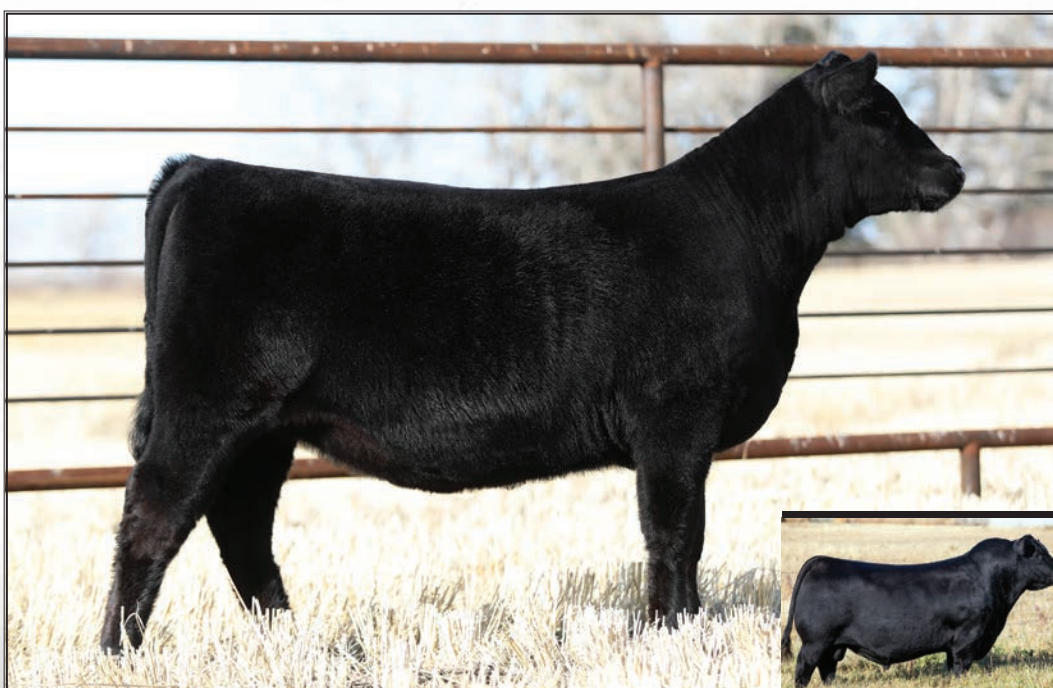
Good View Pride 10K

Goodview Pride 10K is exactly what we dreamt of and hoped for when we introduced her dam into our herd. Stamped with a deep rib and wide back, that is founded by her dam's sire, and arguably the most well-known Brooking Bull, Banknote 4040 him self, we felt that if length of spine could be added it would be a breeding for the ages. With Bar-E-L Hammertime 95H making his entrance into our herd in 2022, the results and expectations were immediately noted.