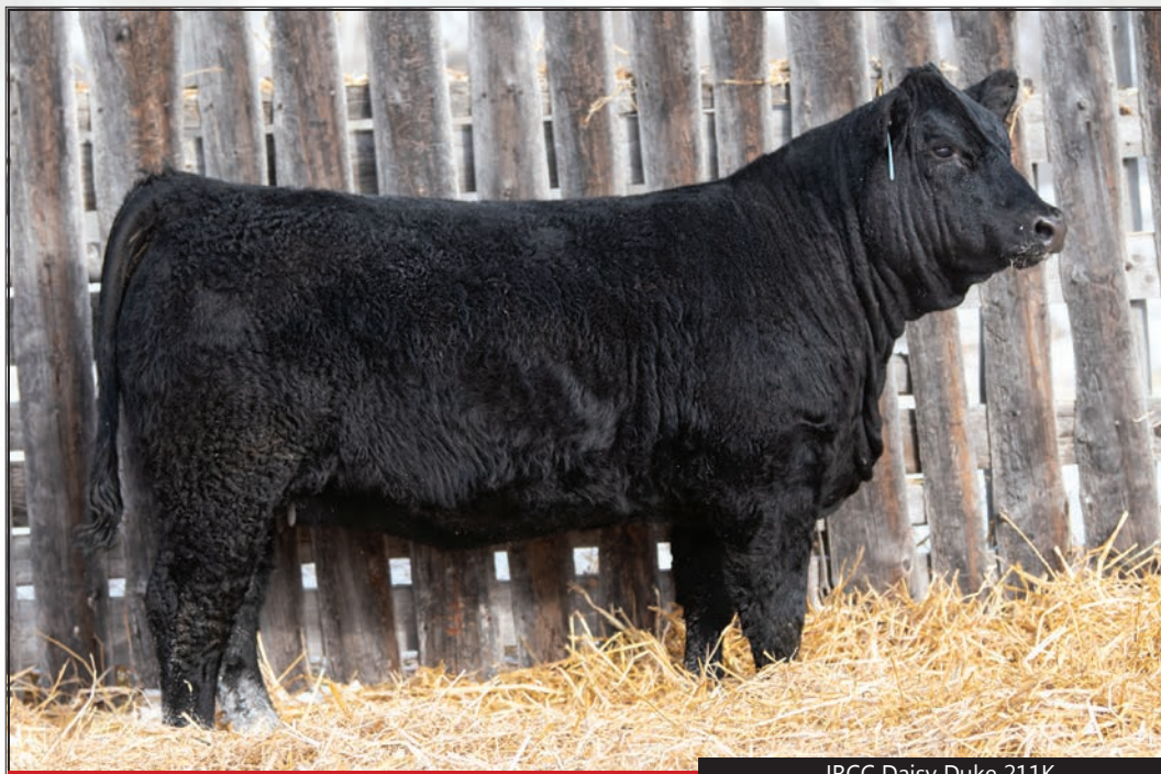
JRCC Daisy Duke 211K

If you are looking for a heifer with power and class in her genetics, this is one to take a look at. Daisy Duke is a big girl with having a wide back, square quarter and deep in her rib. What is so eye appealing about her is her front end, which is very feminine. Daisy Duke has many power cows in her blood line, which has been proven by her dam and sisters. Her sire Bomb showed his power this year in the high weaning weights in our bull pen. Raising the calves of tomorrow, Daisy Duke is the one you have to look hard at.