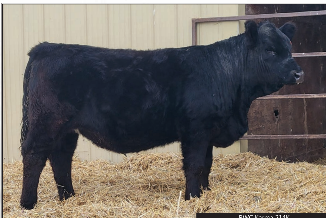
RWC Karma 214K

We at Rocking WC livestock feel that we have brought a nice heifer to town. Karma has a great head and neck that ties into her middle third very nicely. She will be a moderate cow, but will have lots of rib capacity like her dam. Her Grandsire Westerdale 6E speaks for himself. And combine that with Kuntz Sheriff 8A and the famous WLB 47Y cow on the bottom side and you will have a producer in the making.