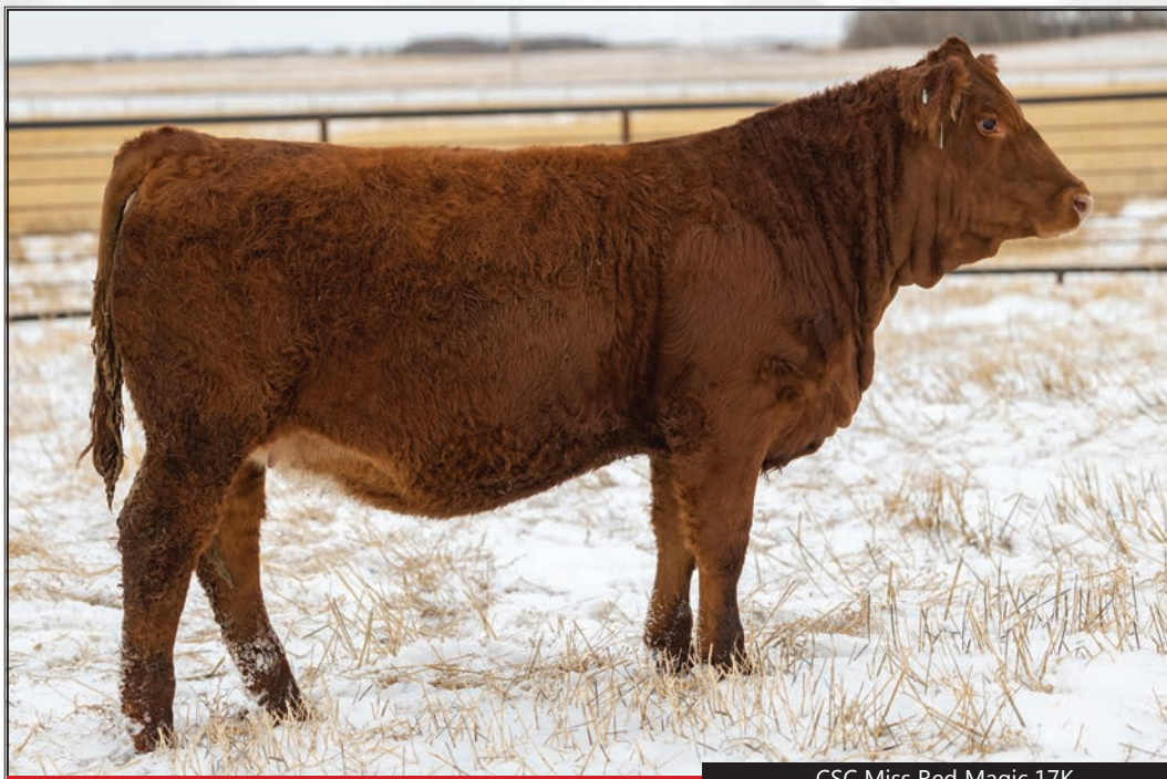
CSC Miss Red Magic 17K

We have brought you the best heifer to hit the ground at Corner Stone. This SVS Tycoon daughter checks all the boxes. Long necked, capacious middle, super stout and dark red. This heifer would love the show ring but she is destined to be a donor just like her mother. We are retaining a flush on this female to be done down the road. Shes got foundation female in her veins!