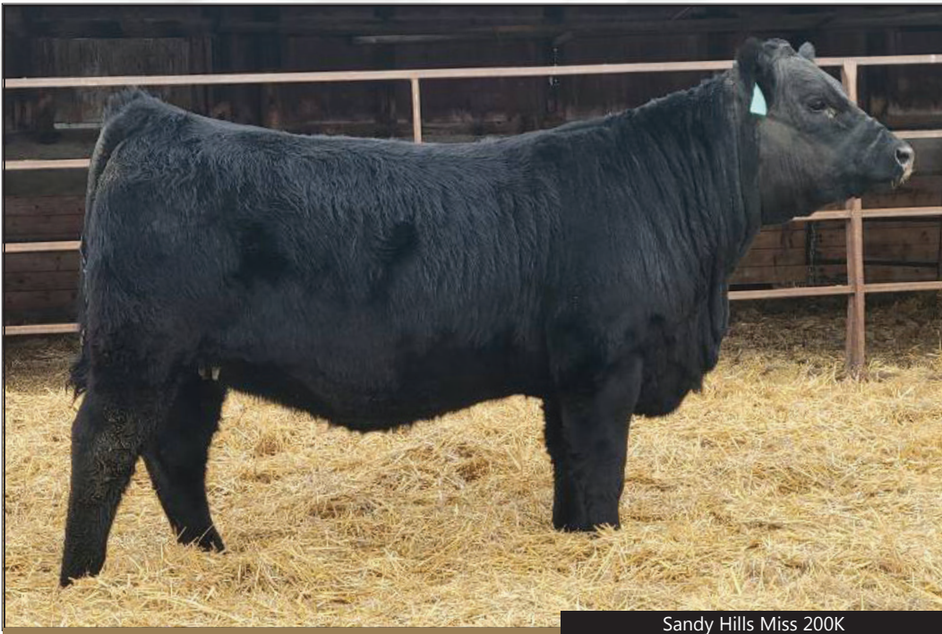
Sandy Hills Miss 200K

An easy favorite among the Angus division we have to offer out of the $60,000 LFE 807G bull. This heifer has been a favorite since she was born. She just hit the ground knowing she was going to be in the top of the pen. She has got it all going for her.