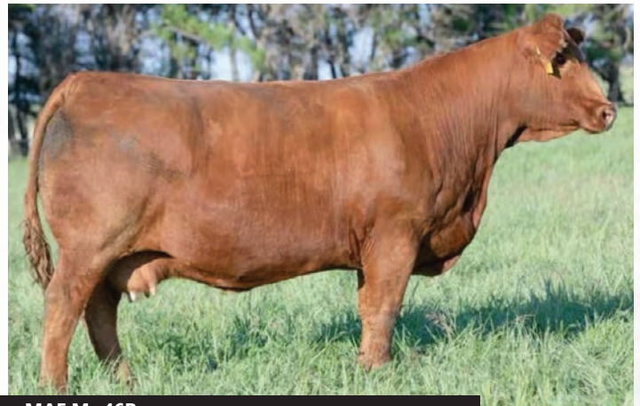
MAF Ms 46B