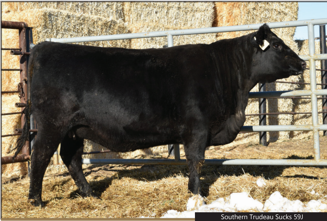
Southern Trudeau Sucks 59J

This heifer takes after her namesake only in the fact that something made overseas can lead her around in a circle! All jokes aside this heifer is thick and soggy and will do a wonderful job as her mother has done for us!