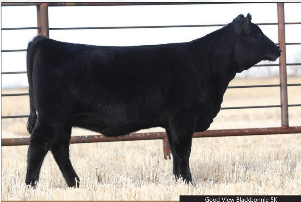
Good View Blackbonnie 5K

Goodview Blackbonnie 5K is the Granddaughter of our BlackBonnie 3D Dam. This Dam has produced top end bull calves for us each year. Strategically we felt best to use Firebrand to further performance of the cow family. 5K carries herself on a great set of feet, and clean structured walk. The width of back is an eye-catching quality that hides the true depth of rib.