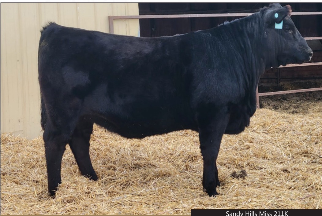
Sandy Hills Miss 211K

If you are looking for a show heifer to hit the road with this is the one for you. Out of the 807G bull, she has got a great disposition, travels great, night low tail head and great depth and performance.