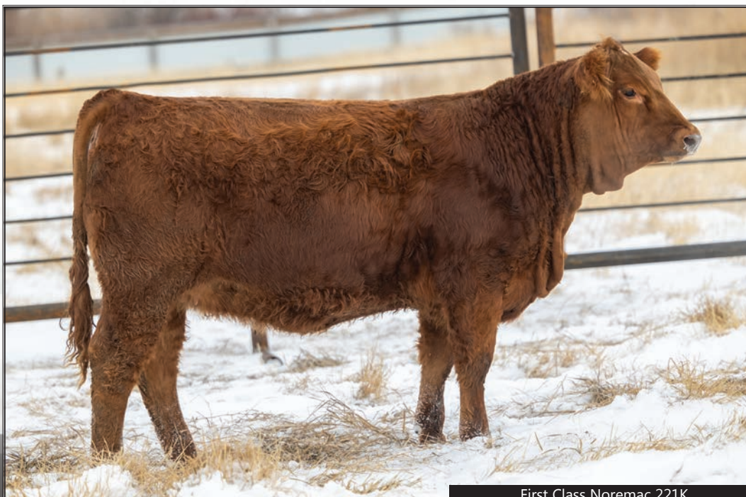
First Class Noremac 221K

Here is a really well made, fancy type of heifer sired by Epic. This female is put together almost perfectly! She's got the top and belly that we need but is also perfect footed and really nice in her front end. If looking for a show prospect look no further.