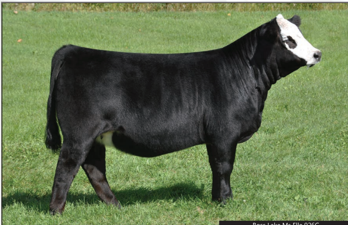
Boss Lake Ms Elle 926G

Flush to be done at a mutually agreed upon facility. Guaranteed 6 freezable embryos, split after 10 or the option to split two flushes if two sires can be agreed upon. Buyer to pay all flushing costs. Ready to flush immediately. Ready to flush by April 1, 2023.