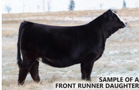
SAMPLE OF A FRONT RUNNER DAUGHTER