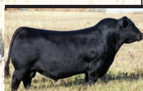
Bank Note 4040 - Grand Sire

The pairing speaks for itself when you see this heifer from any angle, and stand out with a elegant front end and neck extension. 10K possesses a calm mind set and showcases herself with a confident and smooth stride. Females like this that are backed by proven and historical genetics are the kind one can build their herd from. Its because of this that we felt it hard to allow for this offering but are proud to showcase our own herd and efforts to the Angus community knowing she will have an immediate impact on anyone's herd she finds.