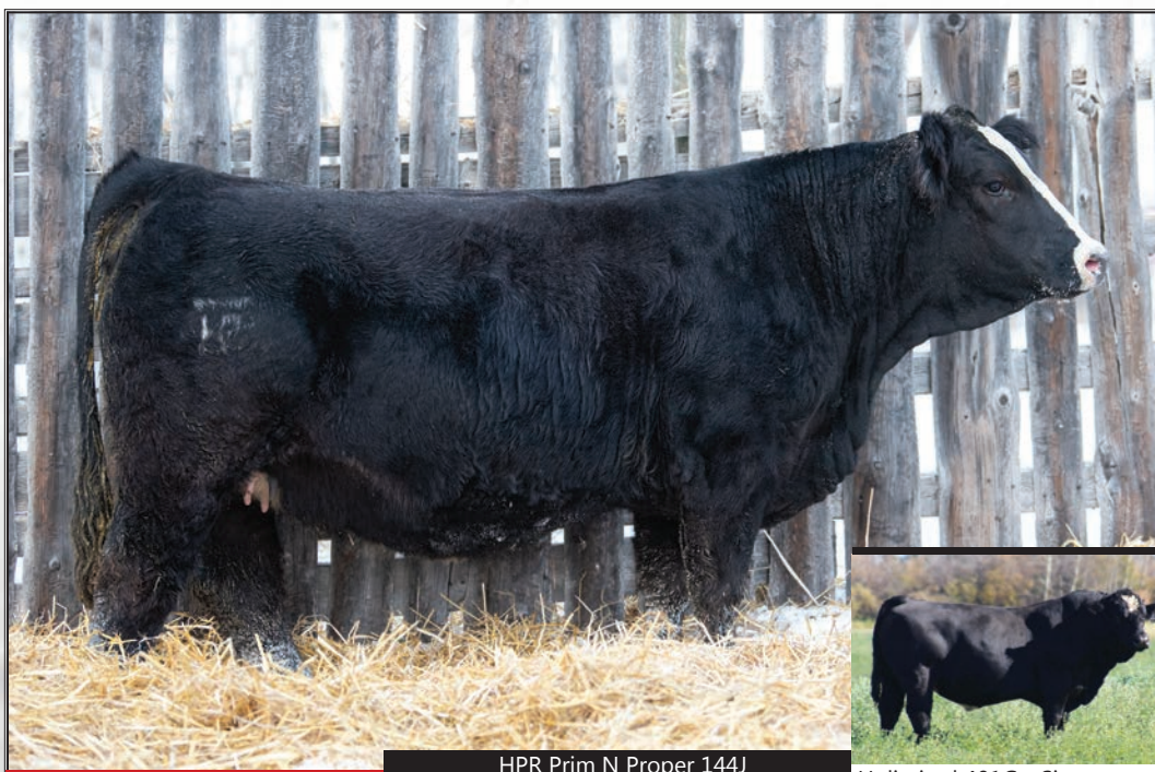
HPR Prim N Proper 144J