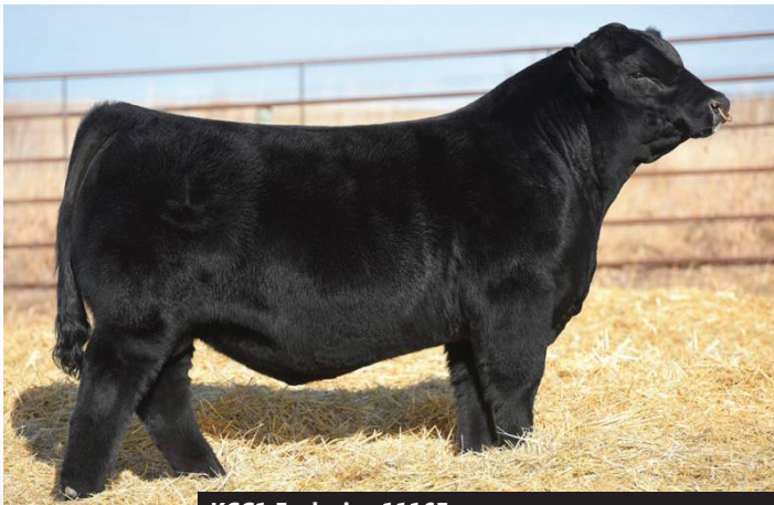
KCC1 Exclusive 1116E